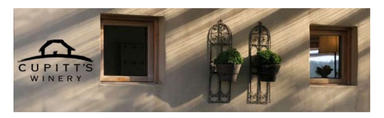
Beautiful scenery. Provincial flavours.

Cupitt's Winery is 5 minutes from Ulladulla, Milton and Mollymook. It has outstanding views to the Budawang ranges and Burril Lake.