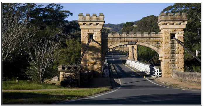
Kangaroo Valley XSW Australia