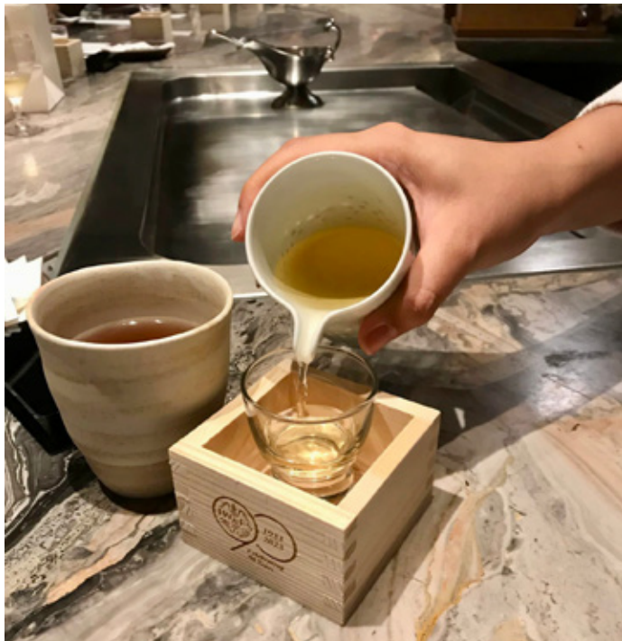
Our 90th Anniversary celebratory glassware took center stage at the dinner.

To celebrate the 90th Anniversary of the IWFS, the Hong Kong Branch created a commemorative sake cup that included the 90th Anniversary logo as gift to members. With sake in mind, a dinner at AKANOSHU restaurant, the latest culinary project by 1957 & Co., (which has hosted several events with the branch) was in store for members and their guests. The evening started with a bubbly reception before a vava-voom experience at the teppanyaki tables. Each dish was paired with two sakes – one aged and the second a rare sake.