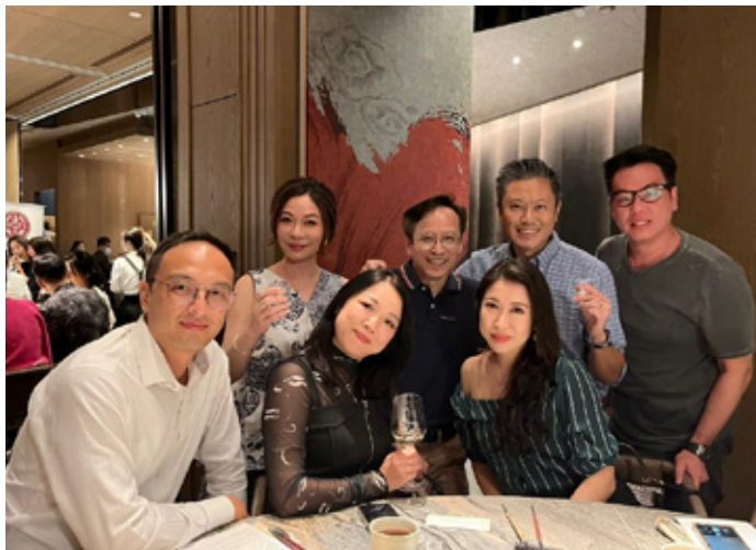
Current and new Members meet over bubbles, wine and sake at Akanoshu to celebrate 90 years of the IWFS.