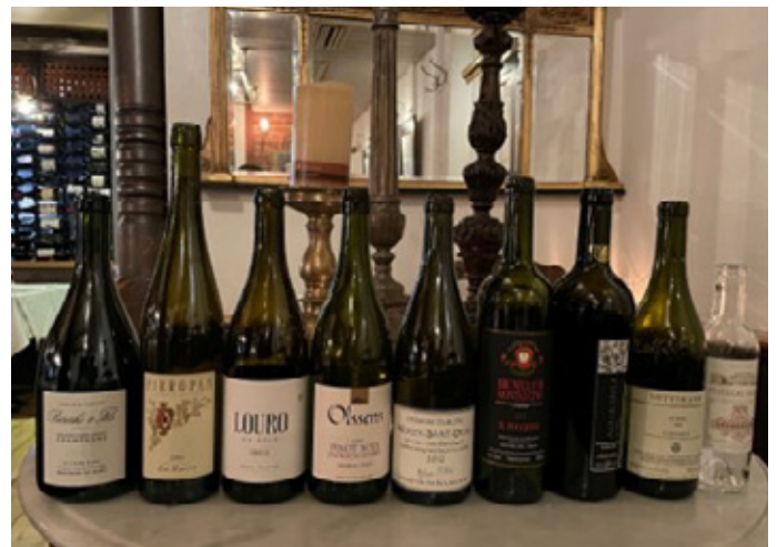
Wine selection at Caterina's